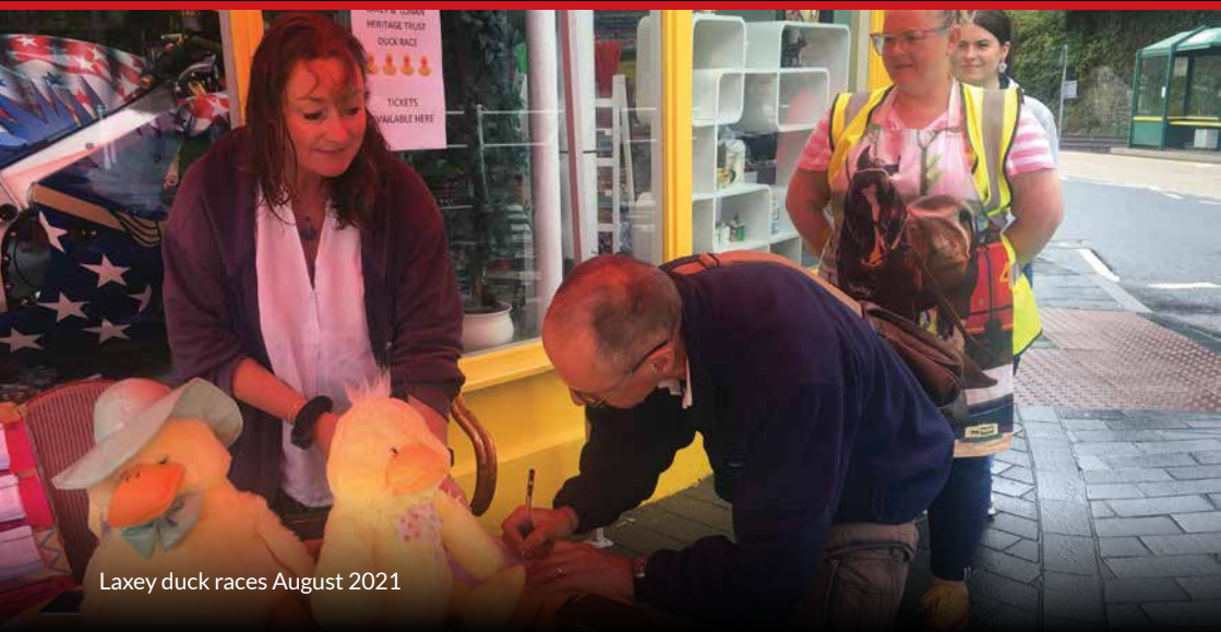
LaxeY duck races August 2021

It has been an honour and a privilege to have represented the people of Garff in Tynwald since 2016.